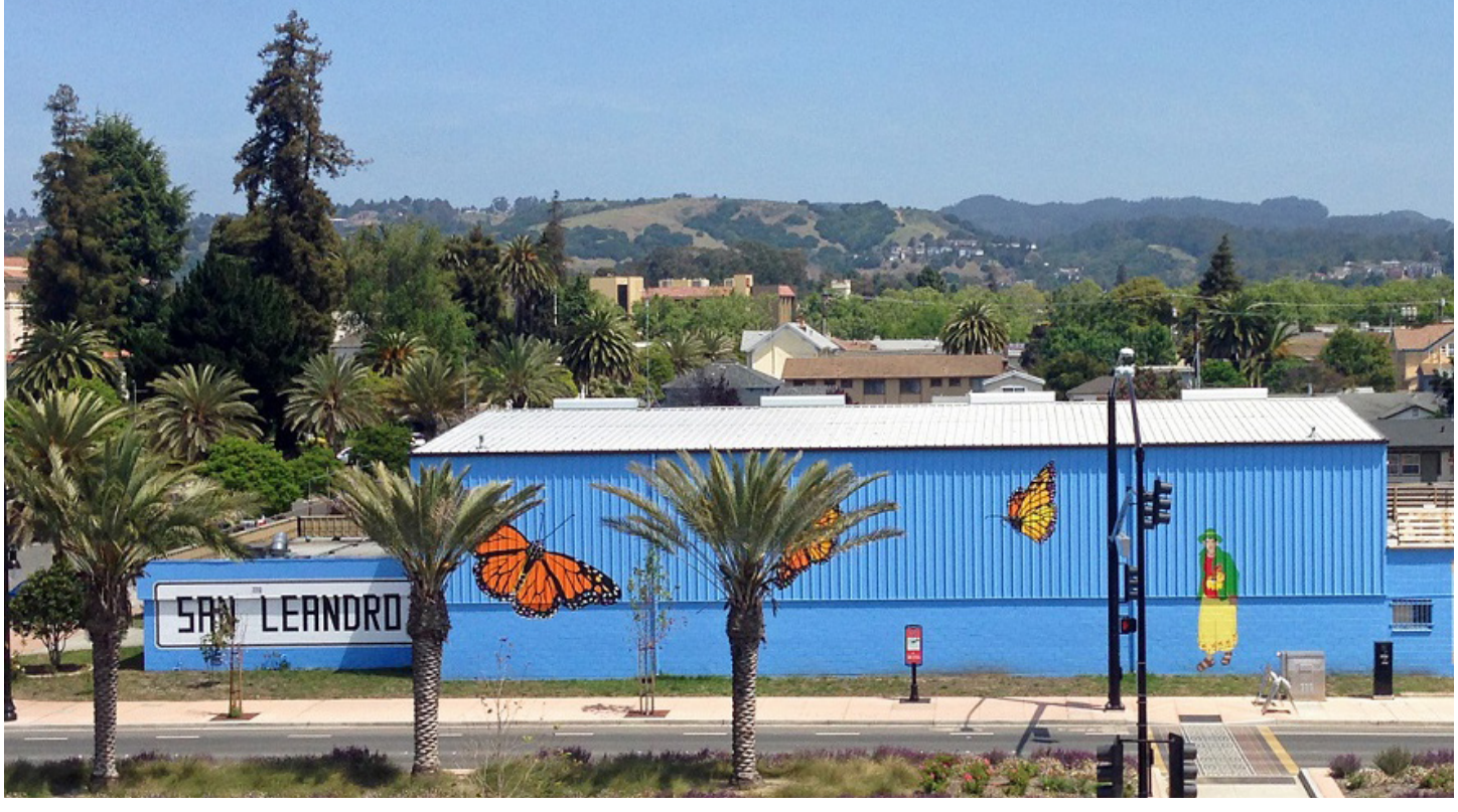
Monarch migration mural, San Leandro, CA. Artist: Rigo 23